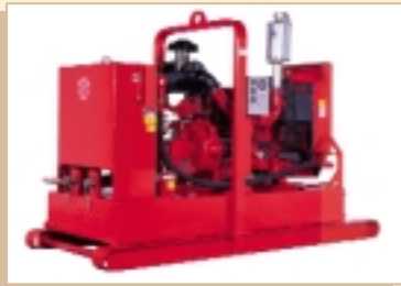
600 Series Hydraulic Power Unit