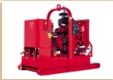
400 Series Hydraulic Power Unit