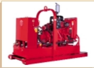
800 Series Hydraulic Power Unit