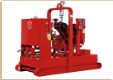
250 Series Hydraulic Power Unit