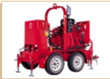
825 Series Hydraulic Power Unit